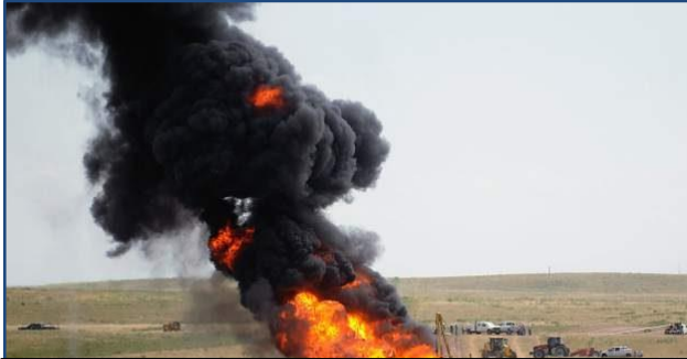
Gas explosion north of Greeley requiring evacuation.

the data or evaluate ways to reduce spills. Of the 509 spills reported in 2016, 82% were on private land and flowback fracking fluid was the source of over half of the spills. 32% were within 1500 feet of an occupied building, but no distance was reported for 52% of the spills. 12 Data from COGCC was analyzed by researchers at the University of CO-Boulder showing that some spills didn't report amounts, and less than half occurring in 2014 were "cleaned up" or closed by 2016. Sixteen percent of spills from 2008-2011 have not been closed. 13