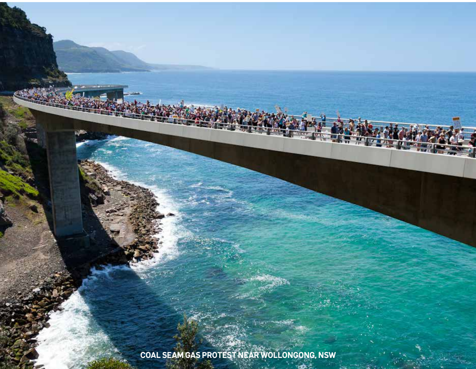
COAL SEAM GAS PROTEST NEAR WOLLONGONG, NSW

Alternatively learn more by downloading ALIGNING COUNCIL MONEY WITH COUNCIL VALUES: A guide to ensuring council money isn't funding climate change.