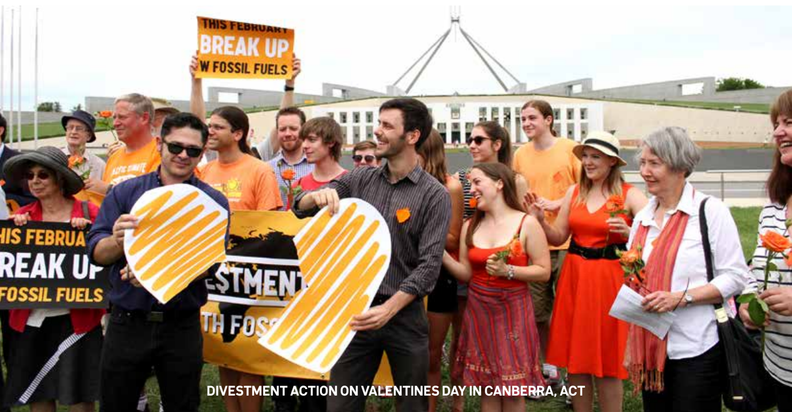
DIVESTMENT ACTION ON VALENTINES DAY IN CANBERRA, ACT

On the 22nd of August, the Australian Capital Territory government divested from fossil fuels. As the territory and local government for Canberra, this decision marked the divestment of Australia's capital city. This also made Australia home to the first capital city in the world to divest from fossil fuels.