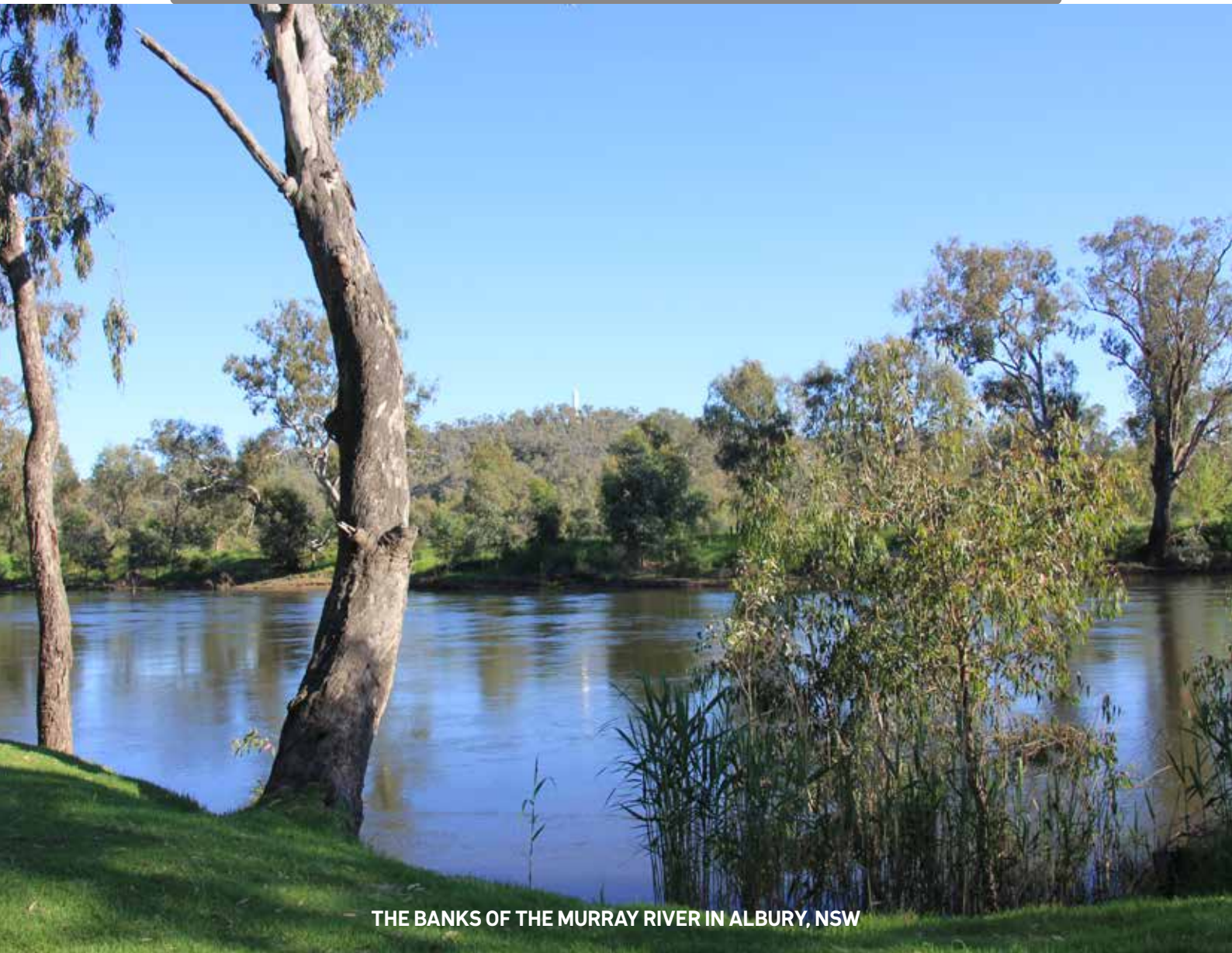
— THE BANKS OF THE MURRAY RIVER IN ALBURY, NSW

“ Several Councils around Australia have made similar decisions and more are looking at divesting from fossil fuels. Residents are also thinking more carefully about where their money is invested and what the consequences of that are. This divestment is a reflection of that. ”